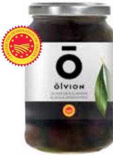
BABY KALAMATA OLIVES (ELIA KALAMATAS PDO) NW: 370g / DW: 200g