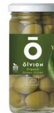
ORGANIC GREEN OLIVES NW: 230g / DW: 150g