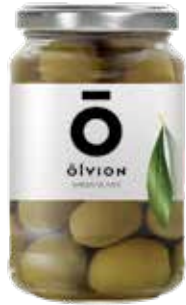
GREEN OLIVES NW: 370g / DW: 200g