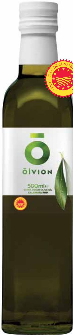
KALAMATA PDO Net Content: 500ml