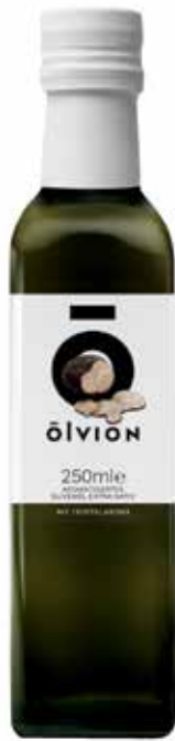
EXTRA VIRGIN OLIVE OIL WITH TRUFFLE FLAVOR Net Content: 250ml