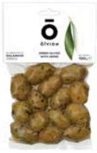
GREEN OLIVES WITH HERBS NW: 100g