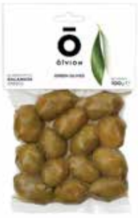
GREEN OLIVES NW: 100g