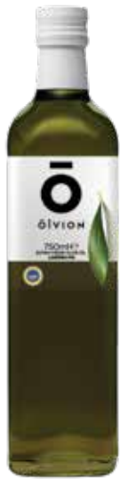
LAKONIA PGI Net Content: 750ml