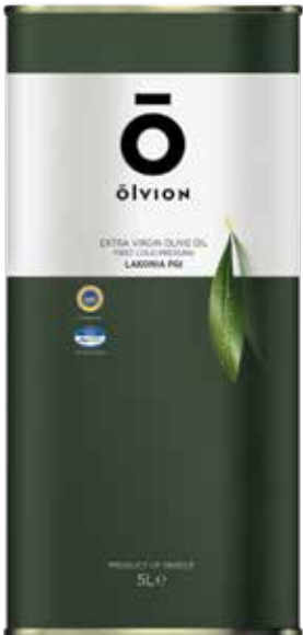
LAKONIA PGI Net Content: 5L