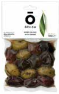
MIXED OLIVES WITH HERBS NW: 100g