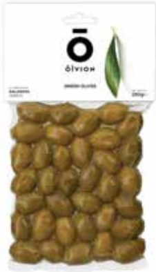
GREEN OLIVES NW: 250g