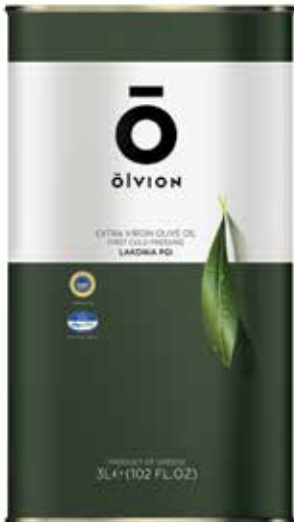
LAKONIA PGI Net Content: 3L