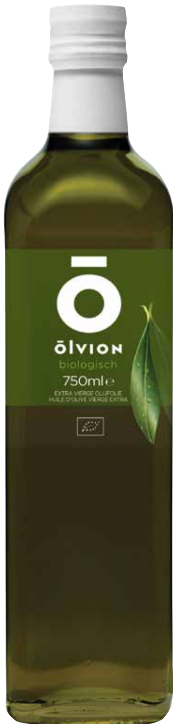
ORGANIC EV00 Net Content: 750ml