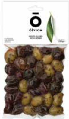
MIXED OLIVES WITH HERBS NW: 250g