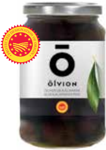
KALAMATA OLIVES (ELIA KALAMATAS PDO) NW: 370g / DW: 200g