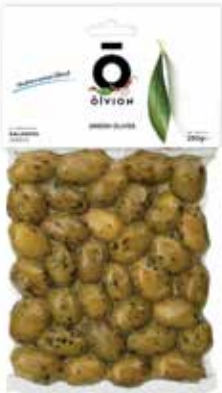
GREEN OLIVES MEDITERRANEAN BLEND NW: 250g