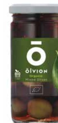
ORGANIC MIXED OLIVES NW: 230g / DW: 150g