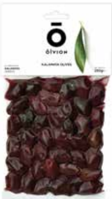
KALAMATA OLIVES NW: 250g