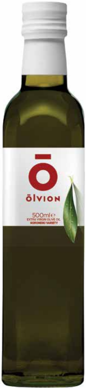
KORONEIKI VARIETY Net Content: 500ml