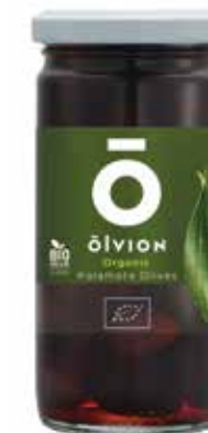
ORGANIC KALAMATA OLIVES NW: 230g / DW: 150g