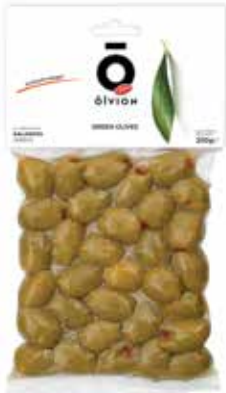
GREEN OLIVES STUFFED WITH RED PEPPERS NW: 250g