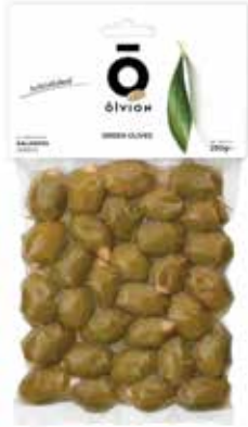
GREEN OLIVES STUFFED WITH ALMOND NW: 250g