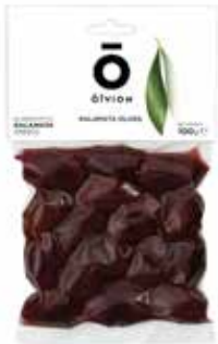
KALAMATA OLIVES NW: 100g