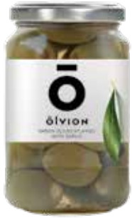
GREEN OLIVES STUFFED WITH GARLIC NW: 370g / DW: 200g