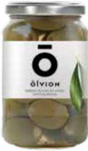
GREEN OLIVES STUFFED WITH ALMOND NW: 370g / DW: 200g