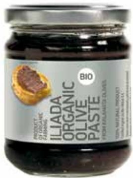
ORGANIC KALAMATA OLIVE PASTE NW: 175g