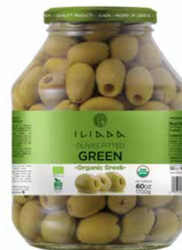
ORGANIC GREEN OLIVES PITTED NW: 1700g | DW: 900g