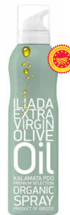
ORGANIC KALAMATA PDO Net Content: 200ml