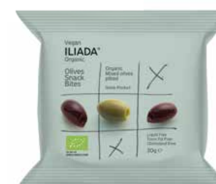
ORGANIC MIXED OLIVES PITTED PILLOW BAG | NW: 30g