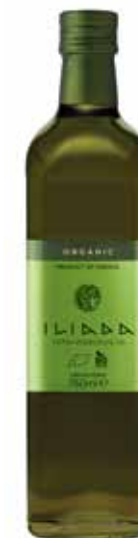
ORGANIC EVOO Net Content: 750ml