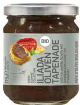
ORGANIC KALAMATA OLIVE PASTE WITH SUNDRIED TOMATOES | NW: 175g