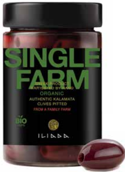
ORGANIC KALAMATA OLIVES PITTED NW: 340g | DW: 160g