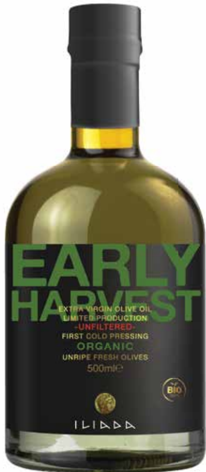
ORGANIC EXTRA VIRGIN OLIVE OIL UNFILTERED Net Content: 500ml