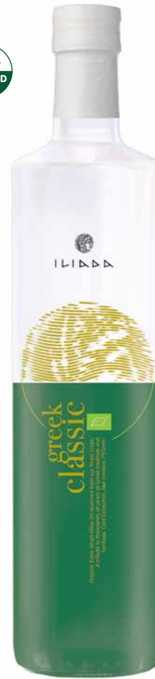
ORGANIC EXTRA VIRGIN OLIVE OIL Net Content: 750ml