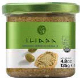
ORGANIC GREEN OLIVE PASTE NW: 135g