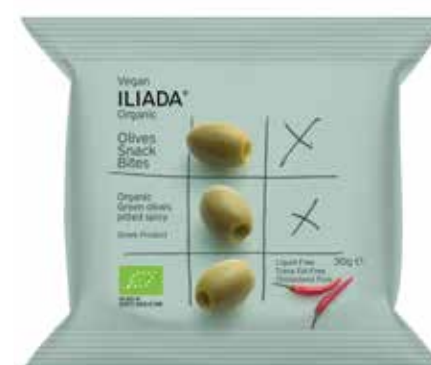
ORGANIC GREEN OLIVES PITTED SPICY PILLOW BAG | NW: 30g