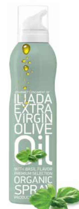
ORGANIC BASIL FLAVOR Net Content: 200ml