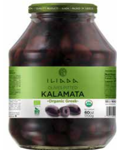
ORGANIC KALAMATA OLIVES PITTED NW: 1700g | DW: 900g