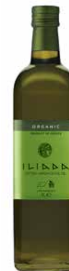
ORGANIC EVOO Net Content: 1L