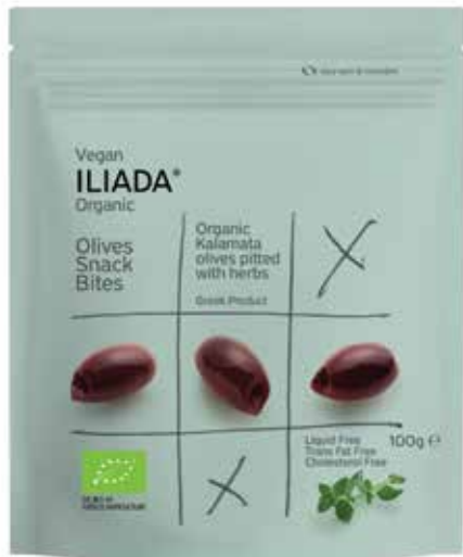
ORGANIC KALAMATA OLIVES PITTED WITH HERBS DOYPACK | NW: 100g