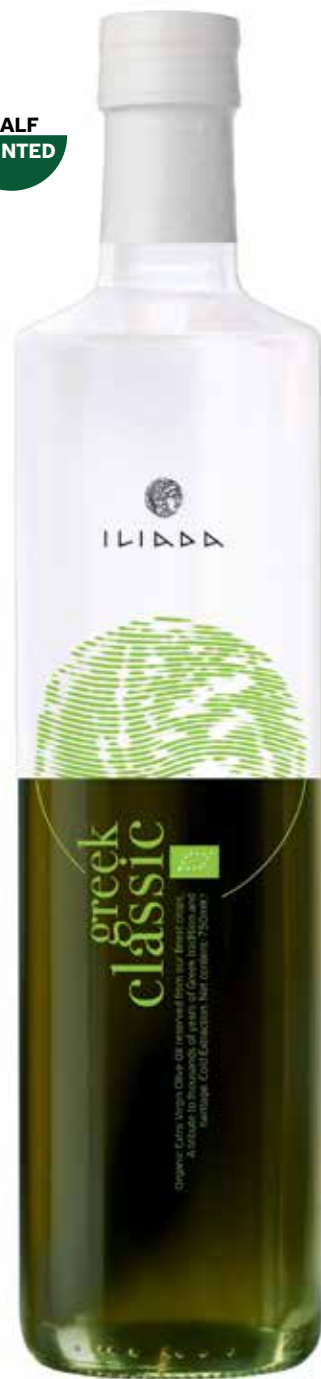
ORGANIC EXTRA VIRGIN OLIVE OIL Net Content: 750ml