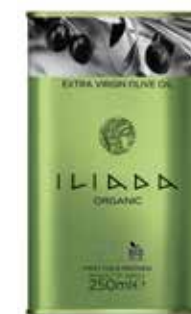
ORGANIC EVOO Net Content: 250ml