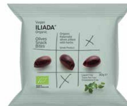
ORGANIC KALAMATA OLIVES PITTED WITH HERBS PILLOW BAG | NW: 30g