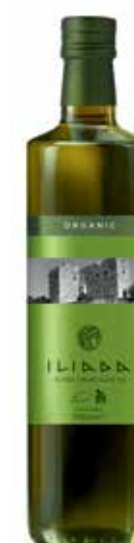
ORGANIC EVOO Net Content: 750ml