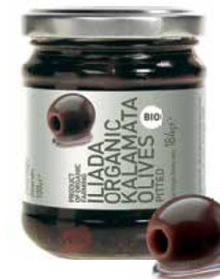
ORGANIC KALAMATA OLIVES PITTED NW: 184g | DW: 100g