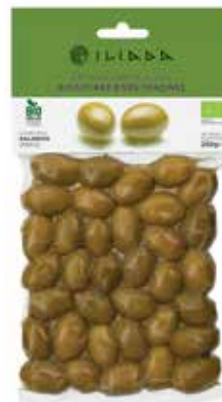
ORGANIC GREEN OLIVES NW: 250g