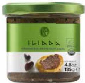
ORGANIC KALAMATA OLIVE PASTE NW: 135g