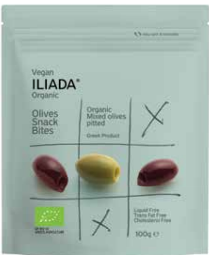
ORGANIC MIXED OLIVES PITTED DOYPACK | NW: 100g