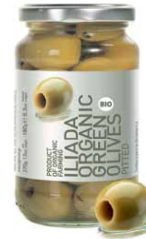
ORGANIC GREEN OLIVES PITTED NW: 370g | DW: 180g