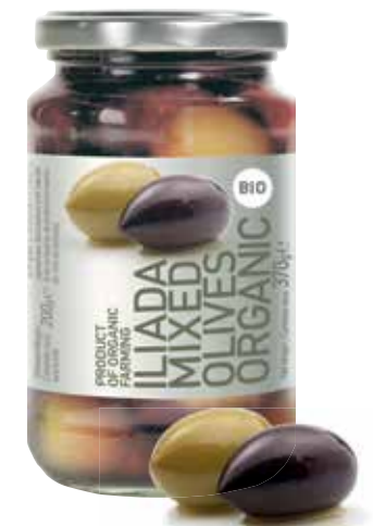
ORGANIC MIXED OLIVES NW: 370g | DW: 200g