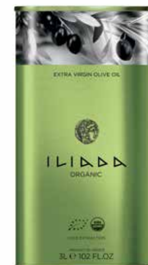
ORGANIC EVOO Net Content: 3L