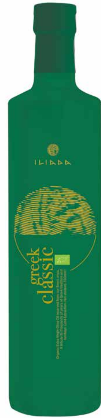
ORGANIC EXTRA VIRGIN OLIVE OIL Net Content: 750ml