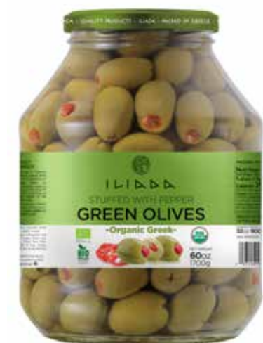
ORGANIC GREEN OLIVES PITTED STUFFED WITH RED PEPPERS NW: 1700g | DW: 900g