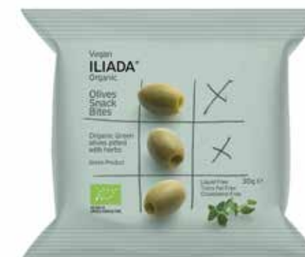
ORGANIC GREEN OLIVES PITTED WITH HERBS PILLOW BAG | NW: 30g