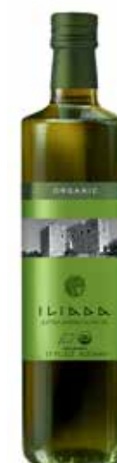
ORGANIC EVOO Net Content: 500ml