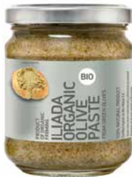
ORGANIC GREEN OLIVE PASTE NW: 175g