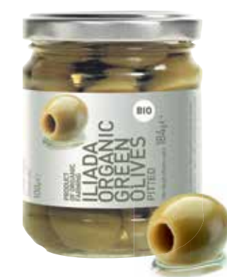
ORGANIC GREEN OLIVES PITTED NW: 184g | DW: 100g