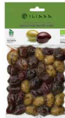
ORGANIC MIXED OLIVES NW: 250g