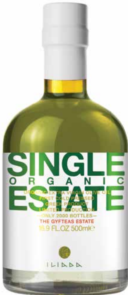
ORGANIC EXTRA VIRGIN OLIVE OIL Net Content: 500ml