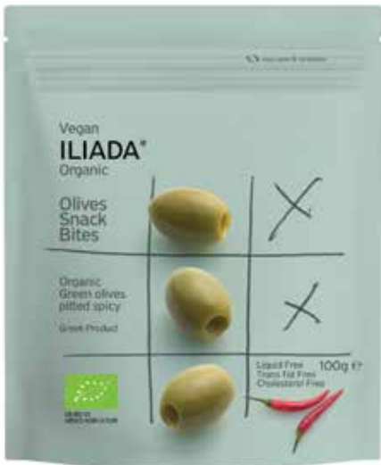
ORGANIC GREEN OLIVES PITTED SPICY DOYPACK | NW: 100g