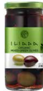
ORGANIC MIXED OLIVES NW: 230g | DW: 150g