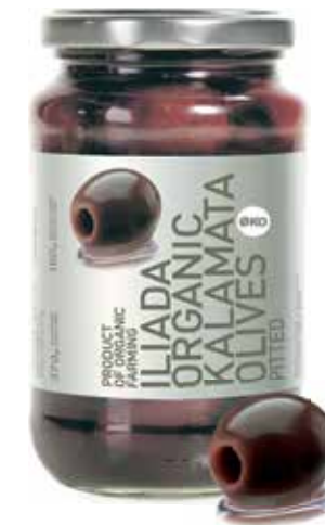
ORGANIC KALAMATA OLIVES PITTED NW: 370g | DW: 180g