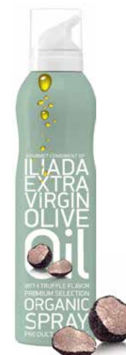
ORGANIC TRUFFLE FLAVOR Net Content: 200ml