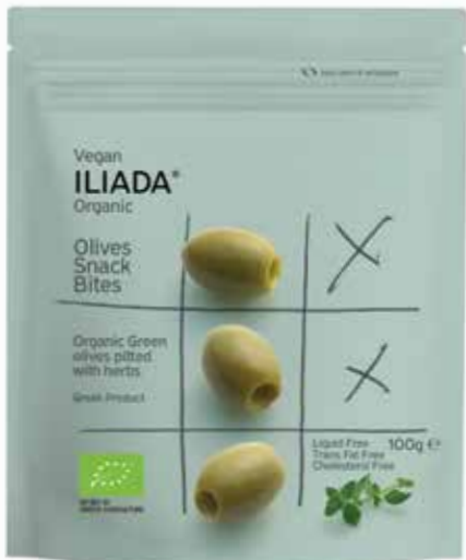
ORGANIC GREEN OLIVES PITTED WITH HERBS DOYPACK | NW: 100g