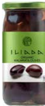
ORGANIC KALAMATA OLIVES NW: 370g | DW: 215g