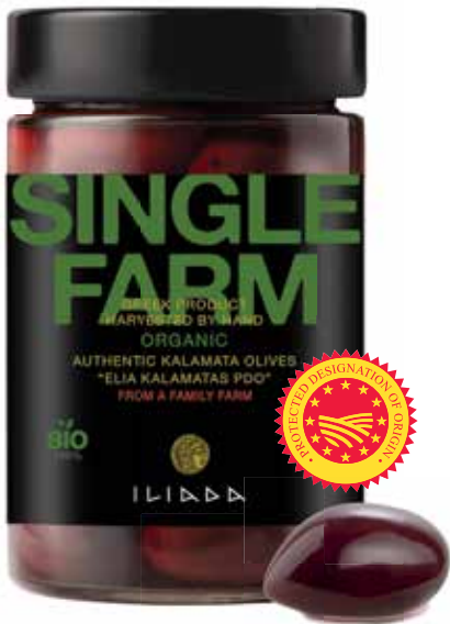
ORGANIC KALAMATA OLIVES (ELIA KALAMATAS PDO) NW: 340g | DW: 190g