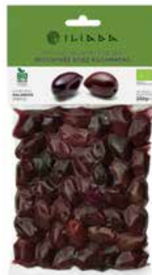
ORGANIC KALAMATA OLIVES NW: 250g