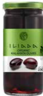
ORGANIC KALAMATA OLIVES NW: 230g | DW: 150g