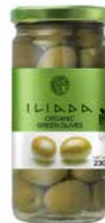
ORGANIC GREEN OLIVES NW: 230g | DW: 150g