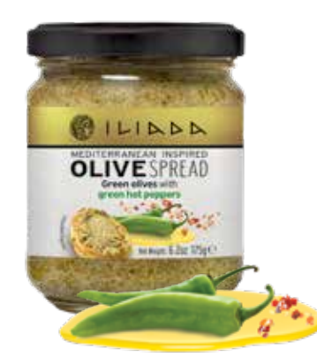
GREEN OLIVE SPREAD WITH GREEN HOT PEPPERS NW: 175g