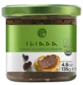
ORGANIC KALAMATA OLIVE PASTE NW: 135g