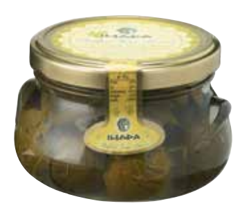
STUFFED VINE LEAVES WITH RICE NW: 280g