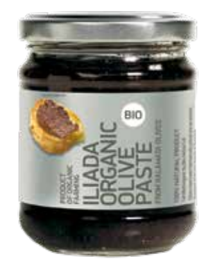
ORGANIC KALAMATA OLIVE PASTE NW: 175g