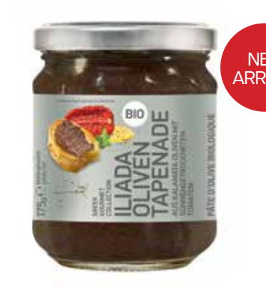
ORGANIC KALAMATA OLIVE PASTE WITH SUNDRIED TOMATOES / NW: 175g