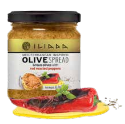
GREEN OLIVE SPREAD WITH RED ROASTED PEPPERS NW: 175g