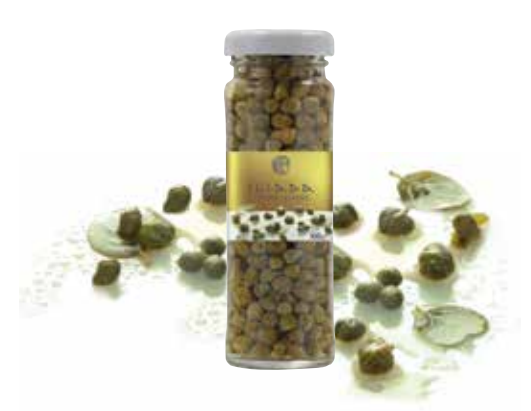
CAPERS NW: 100g / DW: 65g