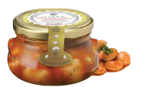
BAKED GIANT BEANS NW: 280g