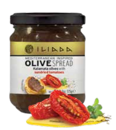
KALAMATA OLIVE SPREAD WITH SUNDRIED TOMATOES NW: 175g