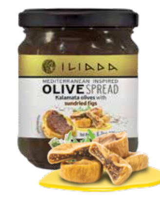
KALAMATA OLIVE SPREAD WITH SUNDRIED FIGS NW: 175g