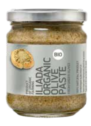
ORGANIC GREEN OLIVE PASTE NW: 175g