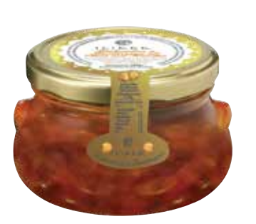
CHICKPEAS NW: 280g