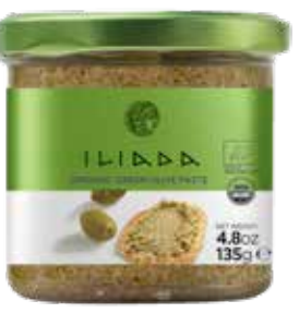
ORGANIC GREEN OLIVE PASTE NW: 135g