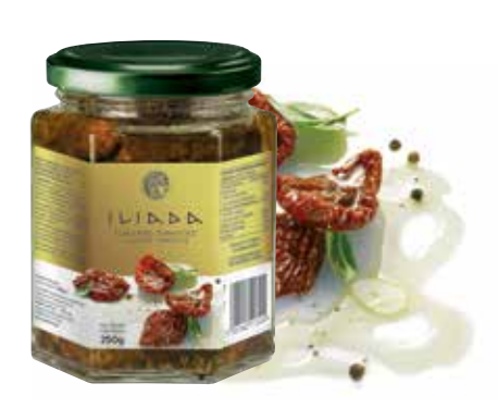
SUNDRIED TOMATOES NW: 280g / DW: 150g