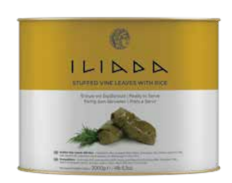
STUFFED VINE LEAVES WITH RICE 60-65 dolmas per tin NW: 2kg