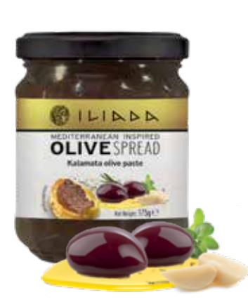
KALAMATA OLIVE SPREAD WITH EXTRA VIRGIN OLIVE OIL NW: 175g