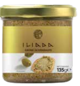
GREEN OLIVE PASTE NW: 135g