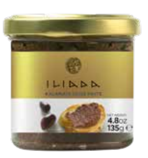
KALAMATA OLIVE PASTE NW: 135g