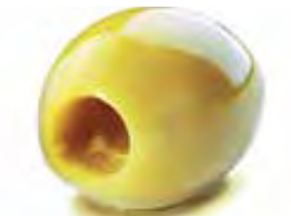
GREEN OLIVES PITTED GIGANTE