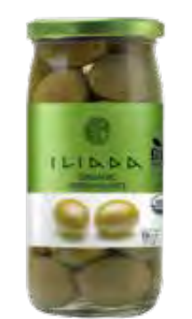
ORGANIC GREEN OLIVES NW: 370g / DW: 215g