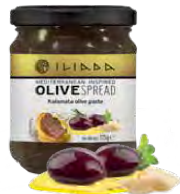
KALAMATA OLIVE SPREAD WITH EXTRA VIRGIN OLIVE OIL NW: 175g