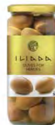
OLIVES FOR HEROES NW: 500g / DW: 300g