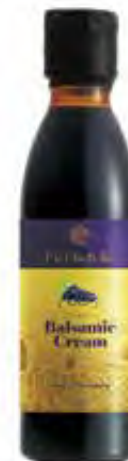
BALSAMIC CREAM PET BOTTLE Net Content: 250ml

A balanced taste between sweetness and acidity