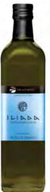
THE AUTHENTIC MARASCA Net Content: 750ml