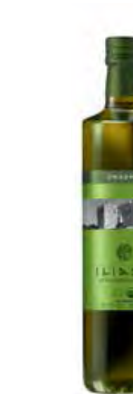
ORGANIC EVOO Net Content: 500ml