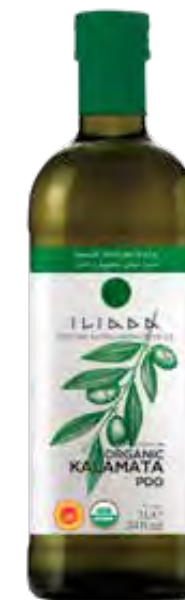
ORGANIC KALAMATA PDO TOSCANO Net Content: 1L