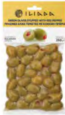
GREEN OLIVES STUFFED WITH RED PEPPERS NW: 250g