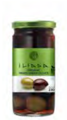
ORGANIC MIXED OLIVES NW: 230g / DW: 150g