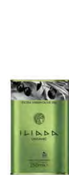
ORGANIC EVOO Net Content: 250ml