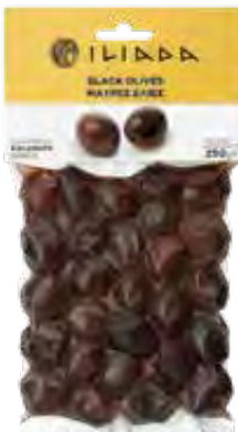
BLACK OLIVES NW: 250g