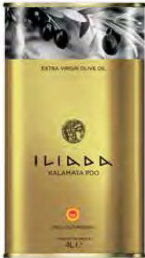
KALAMATA PDO Net Content: 4L