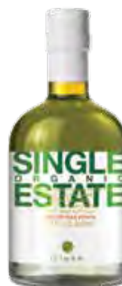
ORGANIC EXTRA VIRGIN OLIVE OIL Net Content: 500ml