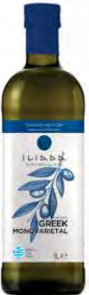
GREEK MONOVARIETAL TOSCANO Net Content: 1L

An olive variety that unlike any other thrives in very high altitudes produces an olive oil with rich taste & flavor.