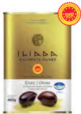
KALAMATA OLIVES IN EXTRA VIRGIN OLIVE OIL (ELIA KALAMATAS PDO) NW: 460g / DW: 250g