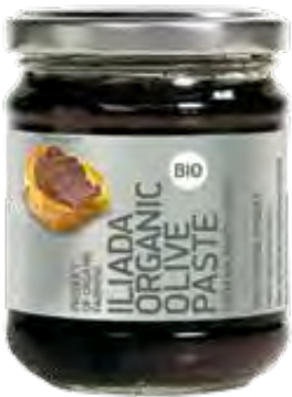
ORGANIC KALAMATA OLIVE PASTE NW: 175g