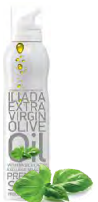
BASIL FLAVOR Net Content: 200ml