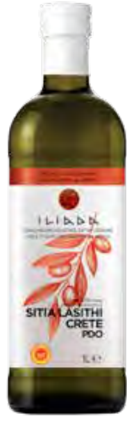
SITIA-LASITHIOU KRITIS PDO TOSCANO Net Content: 1L