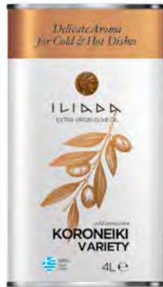
KORONEIKI VARIETY Net Content: 4L