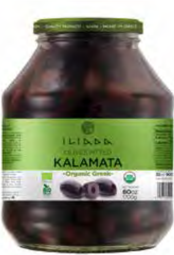
ORGANIC KALAMATA OLIVES PITTED NW: 1700g / DW: 900g