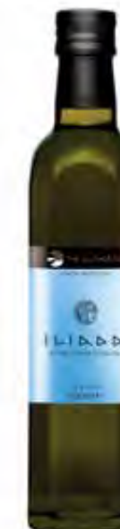
THE AUTHENTIC MARASCA Net Content: 500ml