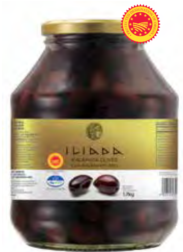
KALAMATA OLIVES (ELIA KALAMATAS PDO) NW: 1700g / DW: 1000g