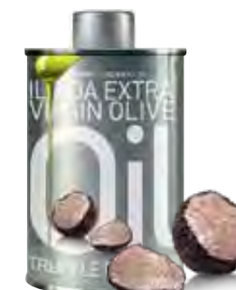
TRUFFLE FLAVOUR Net Content: 250ml