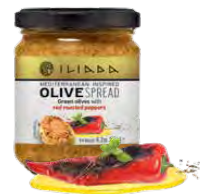
GREEN OLIVE SPREAD WITH RED ROASTED PEPPERS NW: 175g