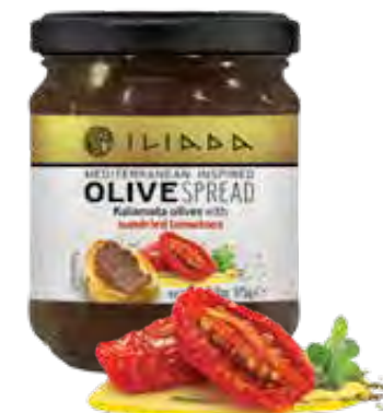
KALAMATA OLIVE SPREAD WITH SUNDRIED TOMATOES NW: 175g