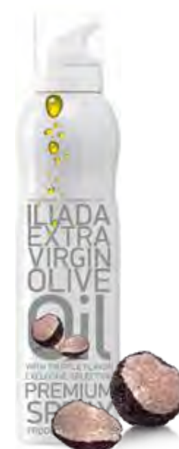
TRUFFLE FLAVOR Net Content: 200ml