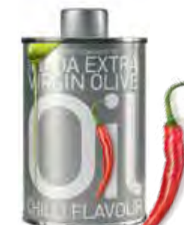
CHILLI FLAVOUR Net Content: 250ml