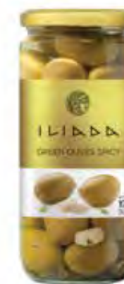
GREEN OLIVES SPICY NW: 500g / DW: 300g