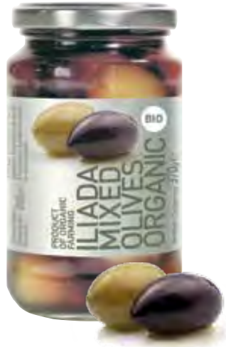
ORGANIC MIXED OLIVES NW: 370g / DW: 200g