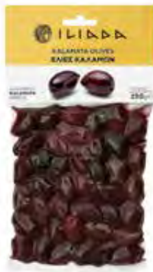
KALAMATA OLIVES NW: 250g