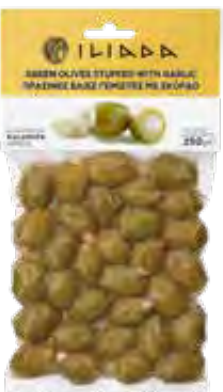
GREEN OLIVES STUFFED WITH GARLIC NW: 250g