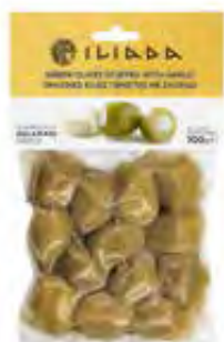
GREEN OLIVES STUFFED WITH GARLIC NW: 100g