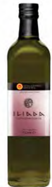
SITIA-LASITHIOU KRITIS PDO MARASCA Net Content: 750ml