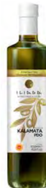
KALAMATA PDO DORICA Net Content: 500ml