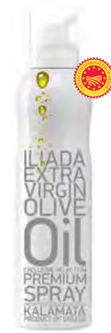
KALAMATA PDO Net Content: 200ml