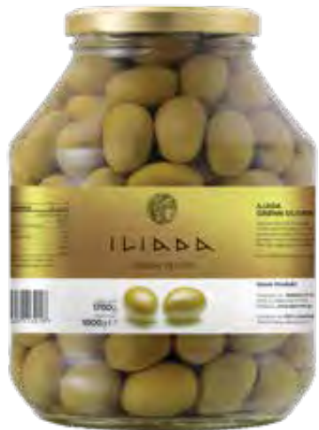
GREEN OLIVES NW: 1700g / DW: 1000g