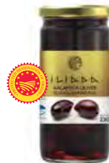
KALAMATA OLIVES (ELIA KALAMATAS PDO) NW: 230g / DW: 150g