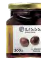
BLACK OLIVES NW: 300g / DW: 170g