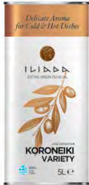
KORONEIKI VARIETY Net Content: 5L