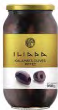
KALAMATA OLIVES PITTED NW: 950g / DW: 520g