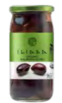
ORGANIC KALAMATA OLIVES NW: 370g / DW: 215g