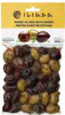
MIXED OLIVES WITH HERBS NW: 250g