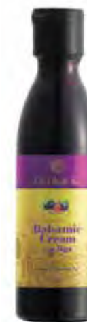
BALSAMIC CREAM WITH FIGS PET BOTTLE Net Content: 250ml