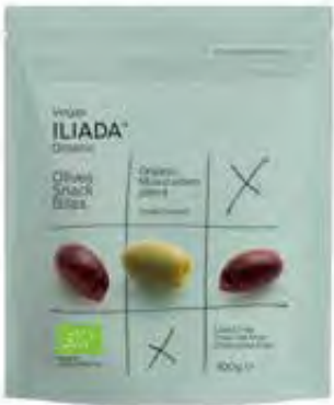
ORGANIC MIXED OLIVES PITTED DOY BAG / NW: 100g