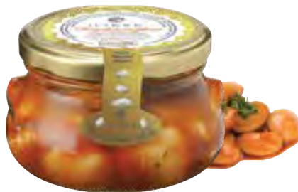
BAKED GIANT BEANS NW: 280g