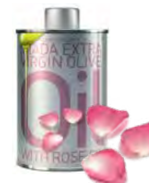
ROSE FLAVOUR Net Content: 250ml