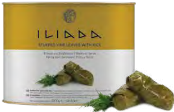
STUFFED VINE LEAVES WITH RICE NW: 2kg