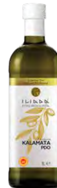
KALAMATA PDO TOSCANO Net Content: 1L