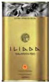
KALAMATA PDO Net Content: 500ml