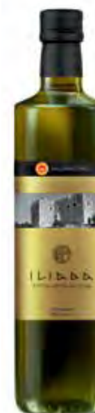
KALAMATA PDO Net Content: 750ml