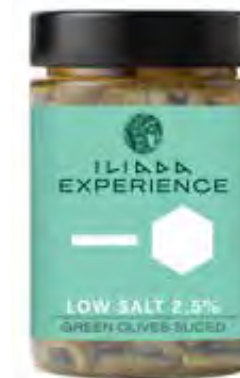
GREEN OLIVES SLICED NW: 340g / DW: 190g