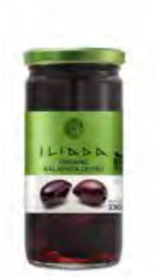
ORGANIC KALAMATA OLIVES NW: 230g / DW: 150g