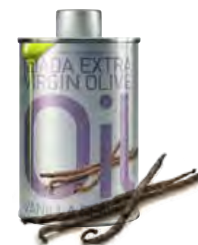
VANILLA FLAVOUR Net Content: 250ml