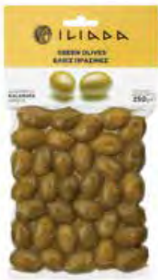
GREEN OLIVES NW: 250g