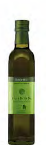
ORGANIC EVOO Net Content: 500ml