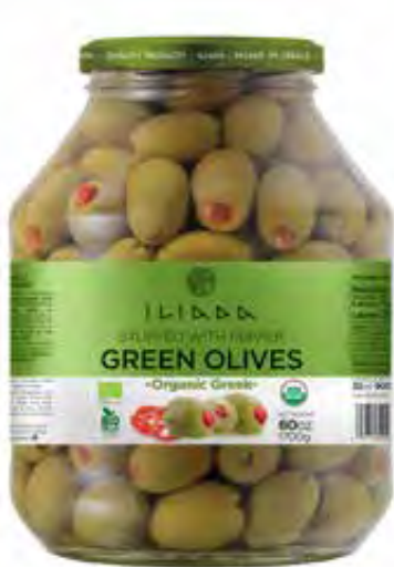
ORGANIC GREEN OLIVES PITTED STUFFED WITH RED PEPPERS NW: 1700g / DW: 900g