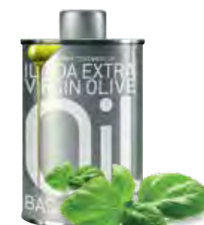
BASIL FLAVOUR Net Content: 250ml