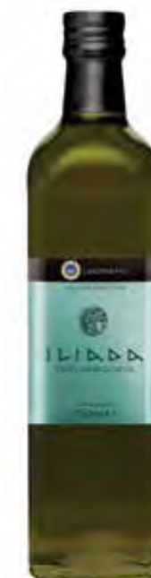
LAKONIA PGI MARASCA Net Content: 750ml