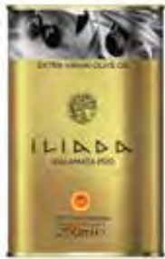
KALAMATA PDO Net Content: 250ml