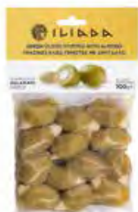
GREEN OLIVES STUFFED WITH ALMOND NW: 100g