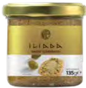
GREEN OLIVE PASTE NW: 135g