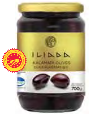
KALAMATA OLIVES (ELIA KALAMATAS PDO) NW: 700g / DW: 400g