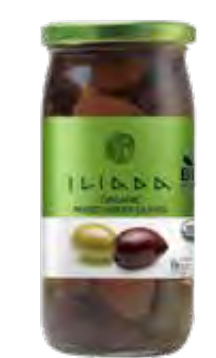
ORGANIC MIXED OLIVES NW: 370g / DW: 190g