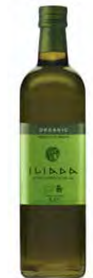
ORGANIC EVOO Net Content: 1L