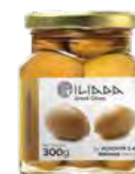
OLIVES FOR HEROES NW: 300g / DW: 215g