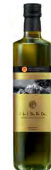
PEZA IRAKLIOU KRITIS PDO Net Content: 500ml