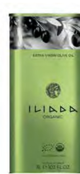
ORGANIC EVOO Net Content: 3L