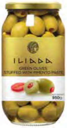
GREEN OLIVES STUFFED WITH PIMENTO PASTE NW: 950g / DW: 580g