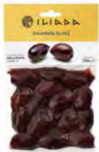
KALAMATA OLIVES NW: 100g