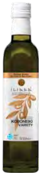
KORONEIKI VARIETY MARASCA Net Content: 500ml