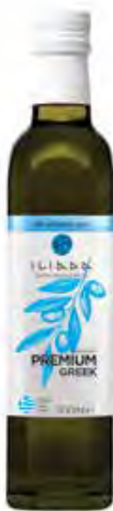
PREMIUM GREEK MARASCA Net Content: 500ml