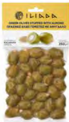
GREEN OLIVES STUFFED WITH ALMOND NW: 250g