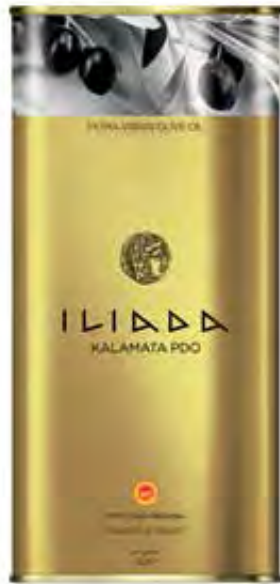
KALAMATA PDO Net Content: 5L