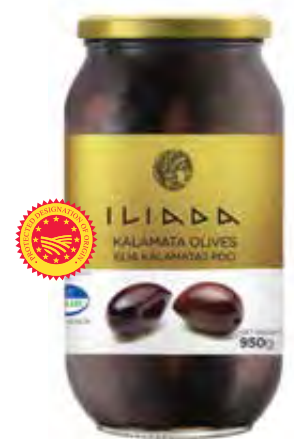
KALAMATA OLIVES (ELIA KALAMATAS PDO) NW: 950g / DW: 580g