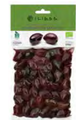
ORGANIC KALAMATA OLIVES NW: 250g