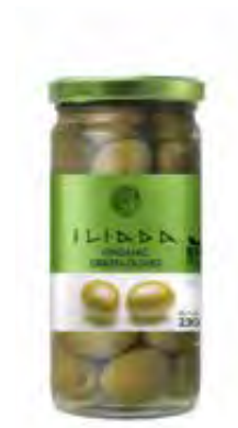
ORGANIC GREEN OLIVES NW: 230g / DW: 150g