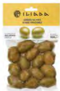
GREEN OLIVES NW: 100g