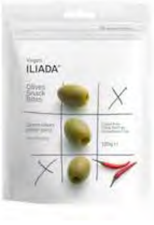
GREEN OLIVES PITTED SPICY DOY BAG / NW: 120g