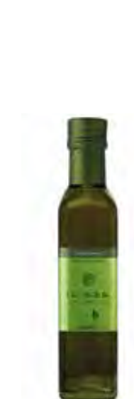
ORGANIC EVOO Net Content: 250ml