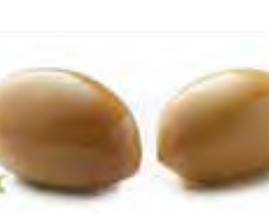
OLIVES FOR HEROES WITH HERBS