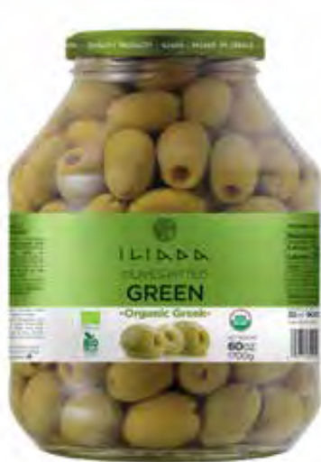
ORGANIC GREEN OLIVES PITTED NW: 1700g / DW: 900g