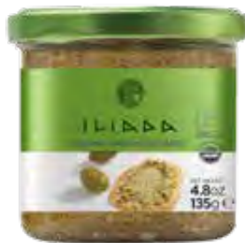
ORGANIC GREEN OLIVE PASTE NW: 135g