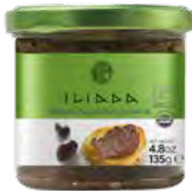
ORGANIC KALAMATA OLIVE PASTE NW: 135g