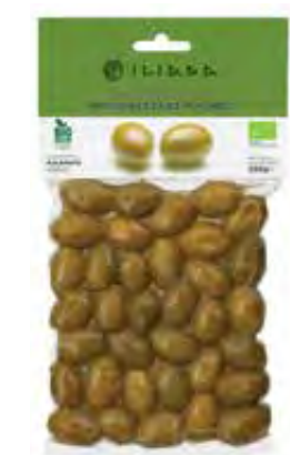
ORGANIC GREEN OLIVES NW: 250g