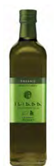
ORGANIC EVOO Net Content: 750ml