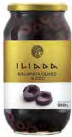
KALAMATA OLIVES SLICED NW: 950g / DW: 580g