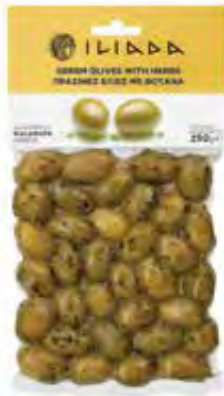
GREEN OLIVES WITH HERBS NW: 250g