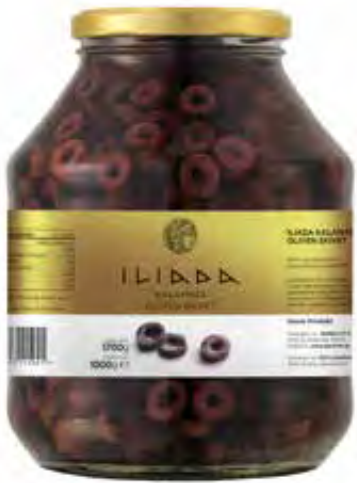
KALAMATA OLIVES SLICED NW: 1700g / DW: 1000g