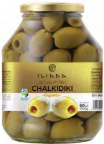
GREEN OLIVES PITTED GIGANTE NW: 1700g / DW: 900g