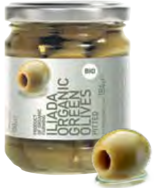
ORGANIC GREEN OLIVES PITTED NW: 184g / DW: 100g