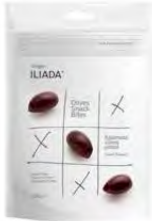
KALAMATA OLIVES PITTED DOY BAG / NW: 170g