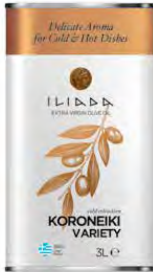
KORONEIKI VARIETY Net Content: 3L