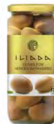
OLIVES FOR HEROES WITH HERBS NW: 500g / DW: 300g