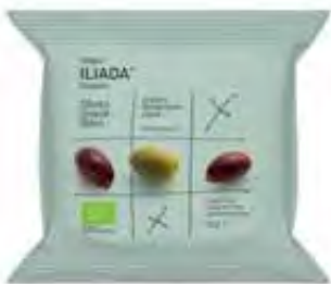
ORGANIC MIXED OLIVES PITTED PILLOW BAG / NW: 30g