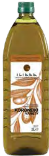
KORONEIKI VARIETY Net Content: 2L