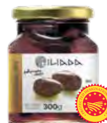
KALAMATA OLIVES (ELIA KALAMATAS PDO) NW: 300g / DW: 170g