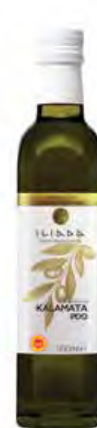
KALAMATA PDO MARASCA Net Content: 500ml