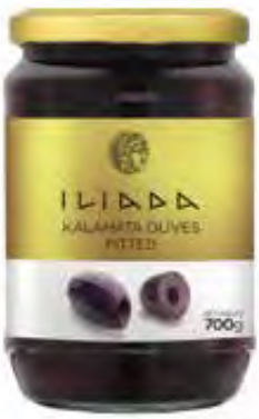
KALAMATA OLIVES PITTED NW: 700g / DW: 400g