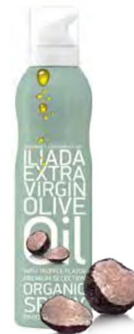
ORGANIC TRUFFLE FLAVOR Net Content: 200ml