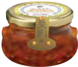
CHICKPEAS NW: 280g