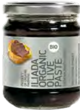
ORGANIC KALAMATA OLIVE PASTE NW: 175g