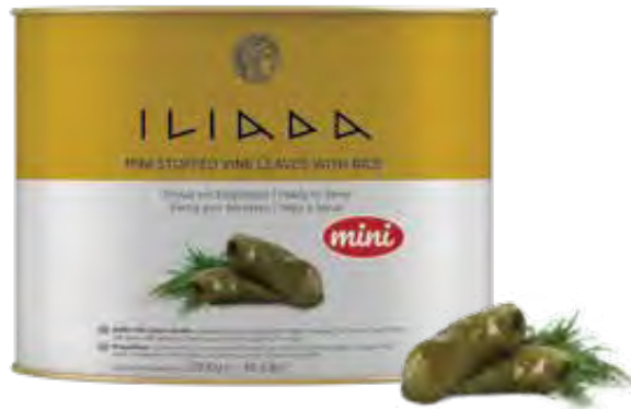
MINI STUFFED VINE LEAVES WITH RICE NW: 2kg

Traditional vinegars from Greek Grapes with exclusive aromas