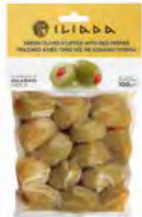
GREEN OLIVES STUFFED WITH RED PEPPERS NW: 100g