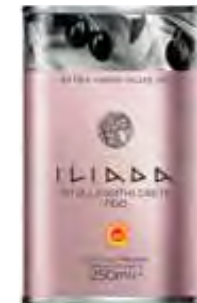
SITIA-LASITHIOU KRITIS PDO METAL TIN Net Content: 250ml