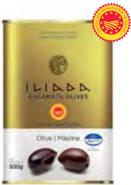
KALAMATA OLIVES (ELIA KALAMATAS PDO) NW: 500g / DW: 250g