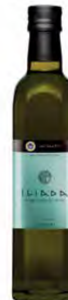
LAKONIA PGI MARASCA Net Content: 500ml