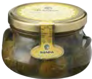
STUFFED VINE LEAVES WITH RICE NW: 280g