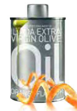
ORANGE FLAVOUR Net Content: 250ml