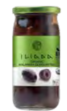
ORGANIC KALAMATA OLIVES PITTED NW: 370g / DW: 190g