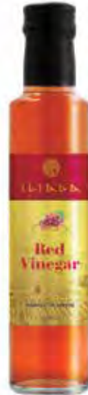
RED VINEGAR DORICA Net Content: 250ml