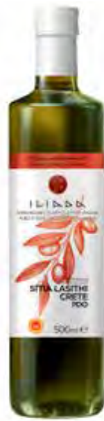
SITIA-LASITHIOU KRITIS PDO DORICA Net Content: 500ml

An authentic Greek monovarietal extra virgin olive oil produced from the Koroneiki variety olives.