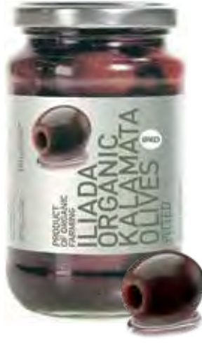
ORGANIC KALAMATA OLIVES PITTED NW: 370g / DW: 180g