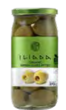
ORGANIC GREEN OLIVES PITTED NW: 370g / DW: 190g