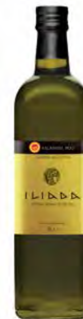
KALAMATA PDO Net Content: 1L