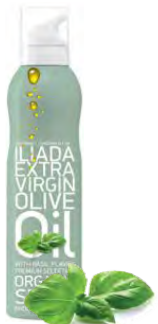
ORGANIC BASIL FLAVOR Net Content: 200ml