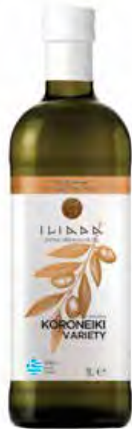
KORONEIKI VARIETY TOSCANO Net Content: 1L