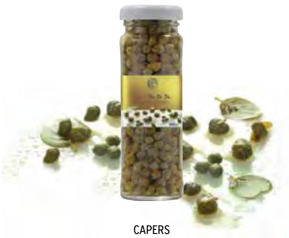
CAPERS NW: 100g / DW: 65g

Traditional Greek recipes to add a special flavor to your dishes