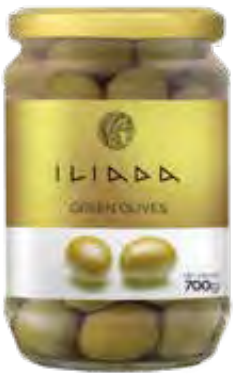
GREEN OLIVES NW: 700g / DW: 400g