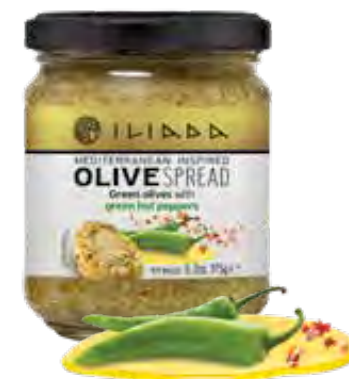
GREEN OLIVE SPREAD WITH GREEN HOT PEPPERS NW: 175g