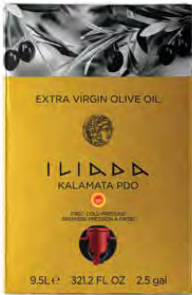
KALAMATA PDO Net Content: 9,5L