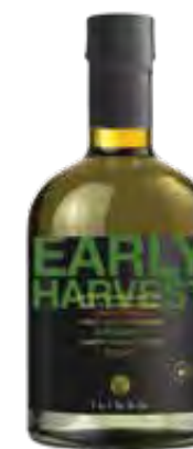
ORGANIC EXTRA VIRGIN OLIVE OIL UNFILTERED Net Content: 500ml