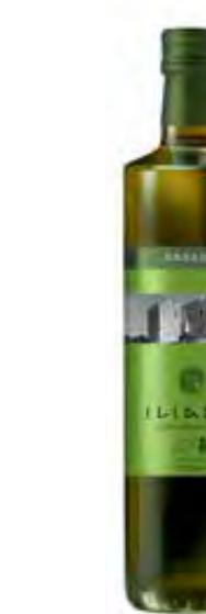
ORGANIC EVOO Net Content: 750ml