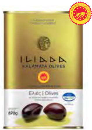
KALAMATA OLIVES IN EXTRA VIRGIN OLIVE OIL (ELIA KALAMATAS PDO) NW: 870g / DW: 540g