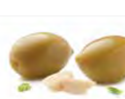
GREEN OLIVES SPICY