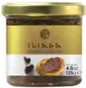
KALAMATA OLIVE PASTE NW: 135g