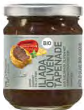
ORGANIC KALAMATA OLIVE PASTE WITH SUNDRIED TOMATOES / NW: 175g