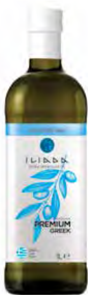
PREMIUM GREEK TOSCANO Net Content: 1L