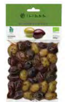
ORGANIC MIXED OLIVES NW: 250g