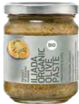
ORGANIC GREEN OLIVE PASTE NW: 175g