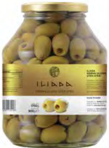
GREEN OLIVES PITTED NW: 1700g / DW: 900g