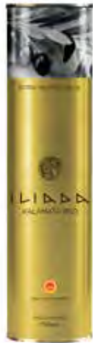
KALAMATA PDO Net Content: 750ml