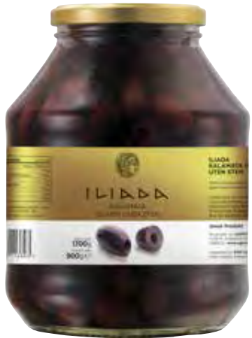
KALAMATA OLIVES PITTED NW: 1700g / DW: 900g