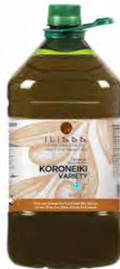
KORONEIKI VARIETY Net Content: 3L