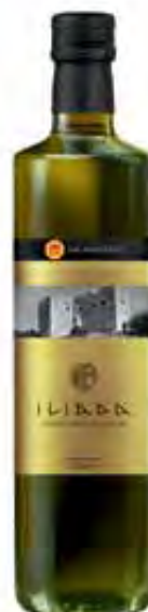
KALAMATA PDO Net Content: 500ml