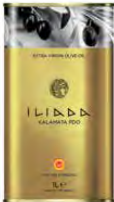
KALAMATA PDO Net Content: 1L