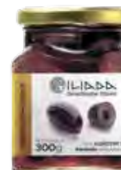
KALAMATA OLIVES PITTED NW: 300g / DW: 150g