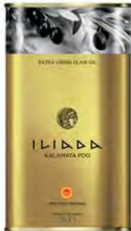
KALAMATA PDO Net Content: 3L