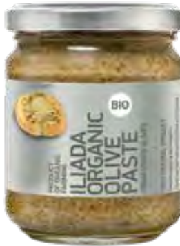
ORGANIC GREEN OLIVE PASTE NW: 175g