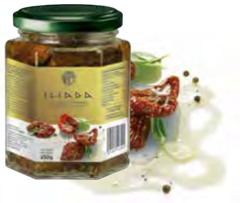
SUNDRIED TOMATOES NW: 280g / DW: 150g