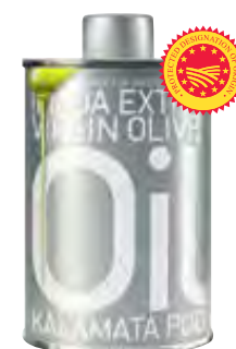
KALAMATA PDO Net Content: 250ml