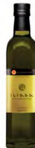
KALAMATA PDO Net Content: 500ml