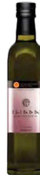
SITIA-LASITHIOU KRITIS PDO MARASCA Net Content: 500ml