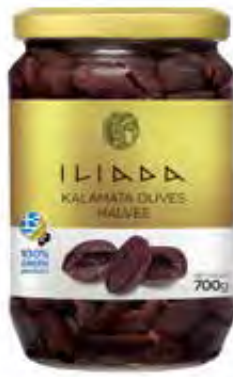
KALAMATA OLIVES HALVES NW: 700g / DW: 400g