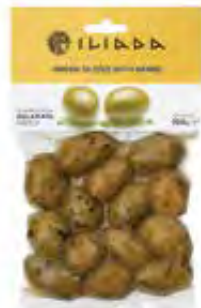
GREEN OLIVES WITH HERBS NW: 100g