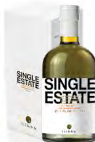
EXTRA VIRGIN OLIVE OIL Net Content: 750ml