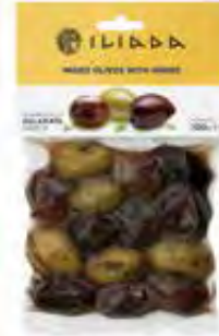
MIXED OLIVES WITH HERBS NW: 100g