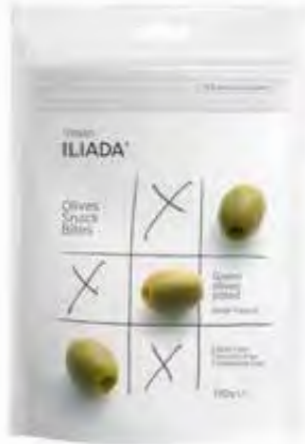
GREEN OLIVES PITTED DOY BAG / NW: 170g