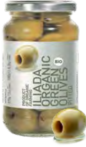
ORGANIC GREEN OLIVES PITTED NW: 370g / DW: 180g