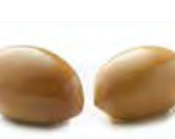
OLIVES FOR HEROES