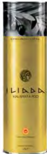
KALAMATA PDO Net Content: 1,5L