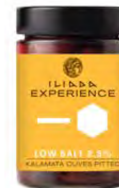
KALAMATA OLIVES PITTED NW: 340g / DW: 160g