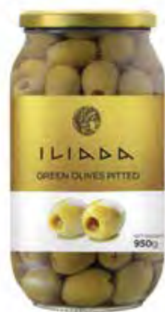
GREEN OLIVES PITTED NW: 950g / DW: 520g