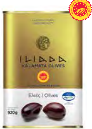
KALAMATA OLIVES (ELIA KALAMATAS PDO) NW: 920g / DW: 540g