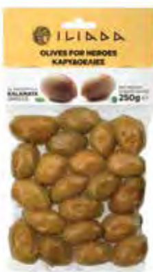
OLIVES FOR HEROES NW: 250g