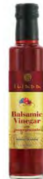
BALSAMIC VINEGAR WITH POMEGRANATE DORICA Net Content: 250ml