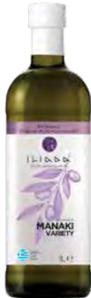
MANAKI VARIETY TOSCANO Net Content: 1L