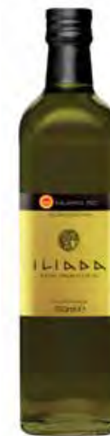
KALAMATA PDO Net Content: 750ml