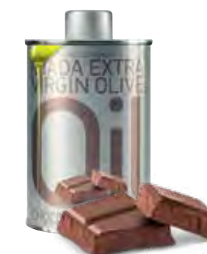
CHOCOLATE FLAVOUR Net Content: 250ml