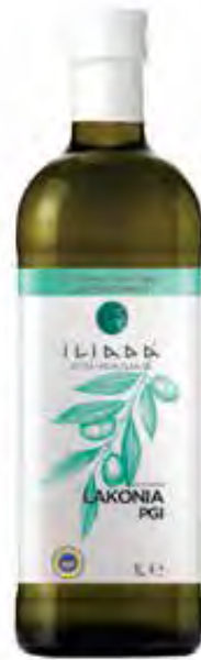
LAKONIA PGI TOSCANO Net Content: 1L