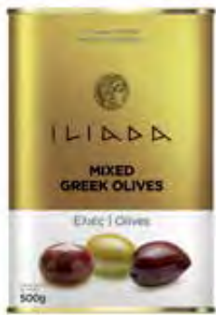
MIXED GREEK OLIVES NW: 500g / DW: 250g