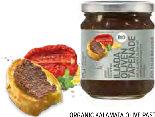
ORGANIC KALAMATA OLIVE PASTE WITH SUNDRIED TOMATOES / NW: 175g