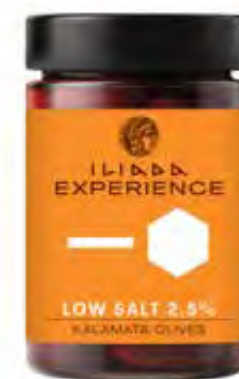
KALAMATA OLIVES NW: 340g / DW: 190g