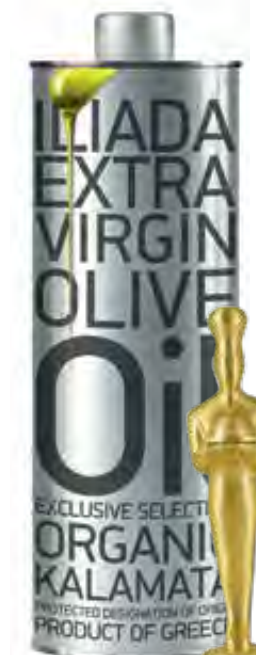
ORGANIC KALAMATA PDO Net Content: 500ml