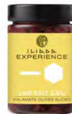
KALAMATA OLIVES SLICED NW: 340g / DW: 190g