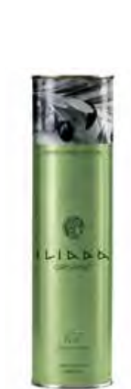
ORGANIC EVOO Net Content: 750ml