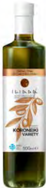
KORONEIKI VARIETY DORICA Net Content: 500ml