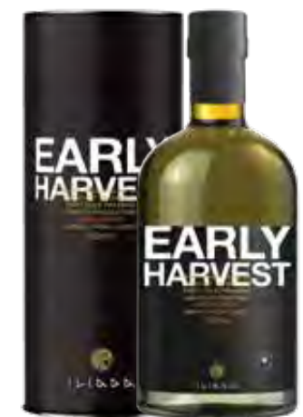
EXTRA VIRGIN OLIVE OIL UNFILTERED Net Content: 750ml