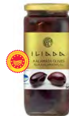
KALAMATA OLIVES (ELIA KALAMATAS PDO) NW: 500g / DW: 300g