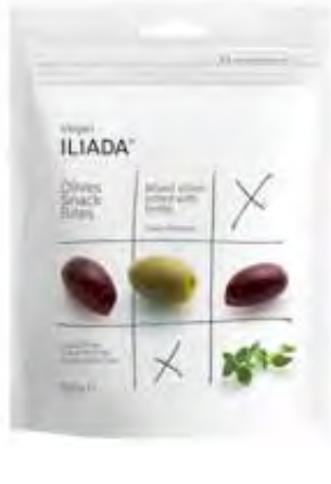
MIXED OLIVES PITTED WITH HERBS DOY BAG / NW: 120g