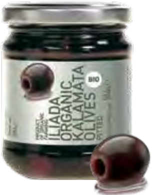
ORGANIC KALAMATA OLIVES PITTED NW: 184g / DW: 100g