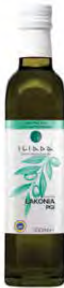
LAKONIA PGI MARASCA Net Content: 500ml

A unique premium extra virgin olive oil obtained from olives grown at selected regions of Greek land.