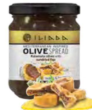
KALAMATA OLIVE SPREAD WITH SUNDRIED FIGS NW: 175g