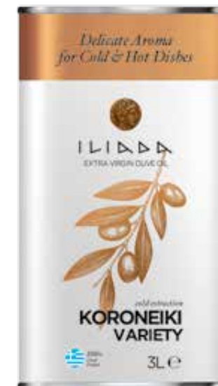
KORONEIKI VARIETY Net Content: 3L