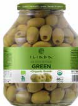
ORGANIC GREEN OLIVES PITTED NW: 1700g / DW: 900g