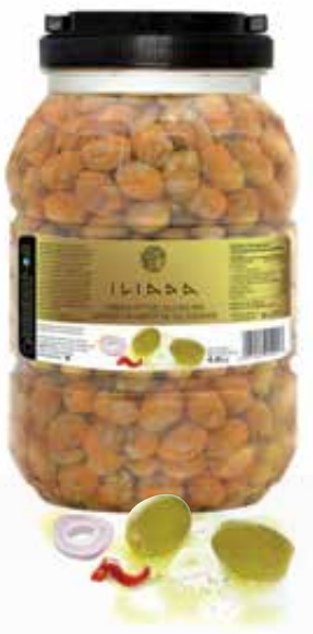
GREEN OLIVES PITTED MIX NW: 4,9kg / DW: 3kg