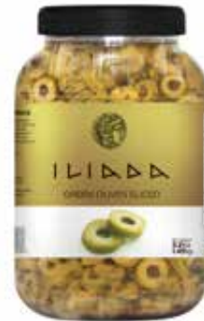
GREEN OLIVES SLICED NW: 1,45kg / DW: 800g