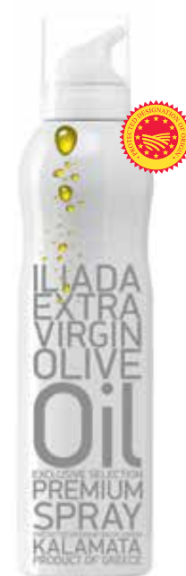
KALAMATA PDO Net Content: 200ml