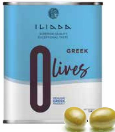
GREEN OLIVES NW: 8kg / DW: 5kg