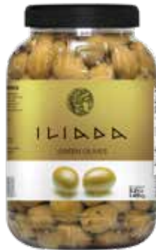
GREEN OLIVES NW: 1,45kg / DW: 900g