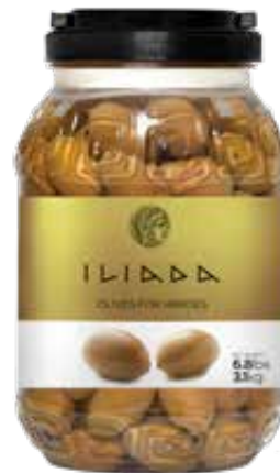
OLIVES FOR HEROES NW: 3,1kg / DW: 1,8kg