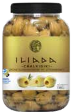
GREEN OLIVE PITTED WITH LEMON NW: 1,45kg / DW: 800g