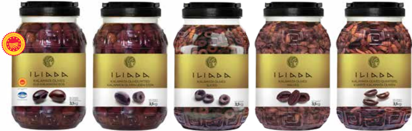
KALAMATA OLIVES (ELIA KALAMATAS PDO) NW: 3,1kg / DW: 1,8kg