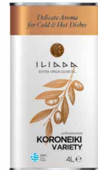
KORONEIKI VARIETY Net Content: 4L