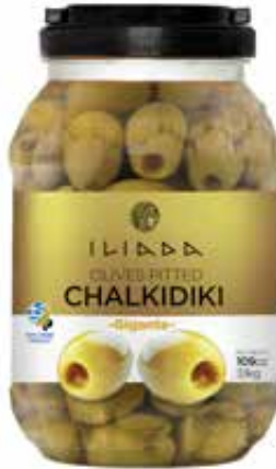
GREEN OLIVES PITTED GIGANTE NW: 3,1kg / DW: 1,6kg