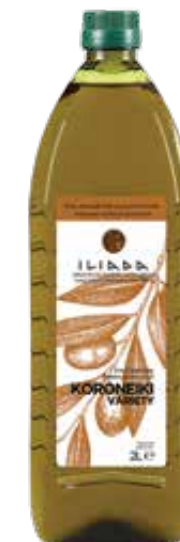
KORONEIKI VARIETY Net Content: 2L