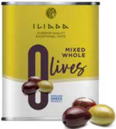
MIXED OLIVES NW: 8kg / DW: 5kg