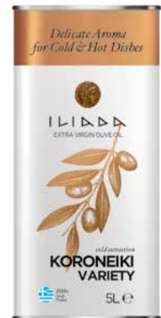
KORONEIKI VARIETY Net Content: 5L