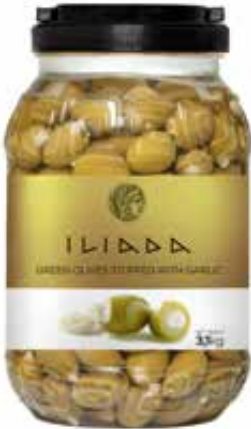
GREEN OLIVES STUFFED WITH GARLIC NW: 3,1kg / DW: 1,8kg