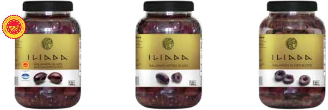
KALAMATA OLIVES (ELIA KALAMATAS PDO) NW: 1,45kg / DW: 900g