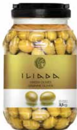
GREEN OLIVES NW: 3,1kg / DW: 1,8kg