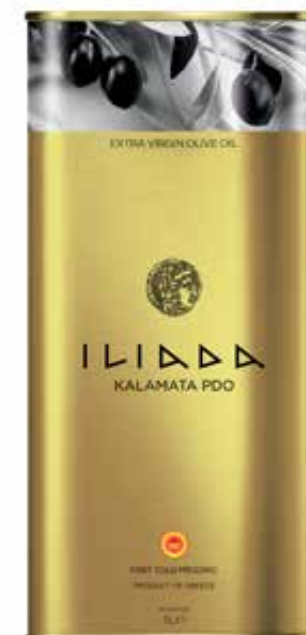
KALAMATA PDO Net Content: 5L