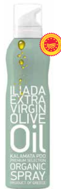
ORGANIC KALAMATA PDO Net Content: 200ml