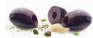
KALAMATA OLIVES PITTED WITH GARLIC