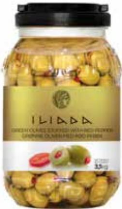
GREEN OLIVES STUFFED WITH RED PEPPERS NW: 3,1kg / DW: 1,8kg