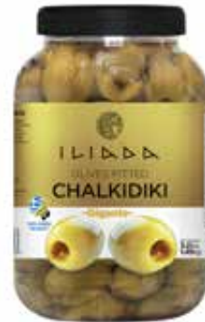
GREEN OLIVES PITTED GIGANTE NW: 1,45kg / DW: 800g