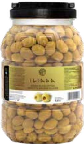
GREEN OLIVES PITTED NW: 5,2kg / DW: 2,7kg