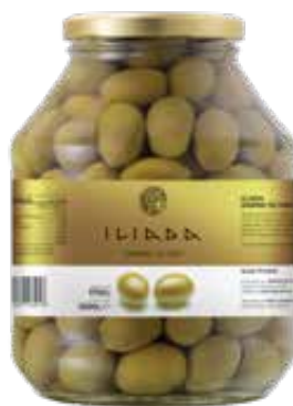
GREEN OLIVES NW: 1700g / DW: 1000g