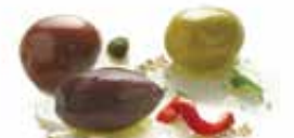
GREEK COCKTAIL OLIVES MIX