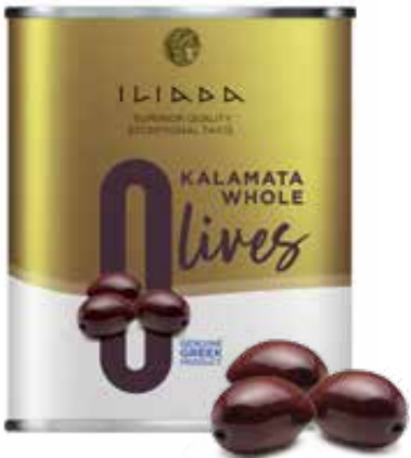
KALAMATA OLIVES NW: 8kg / DW: 5kg