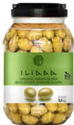
ORGANIC GREEN OLIVES NW: 3,1kg / DW: 1,8kg