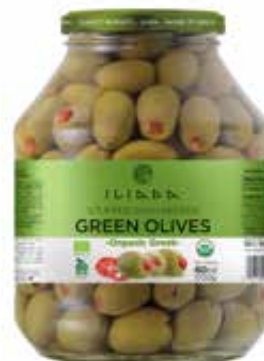
ORGANIC GREEN OLIVES PITTED STUFFED WITH RED PEPPERS NW: 1700g / DW: 900g