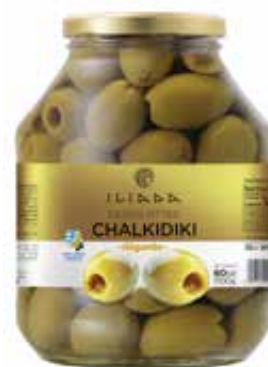
GREEN OLIVES PITTED GIGANTE NW: 1700g / DW: 900g