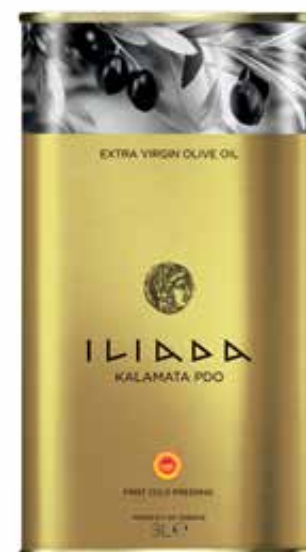
KALAMATA PDO Net Content: 3L