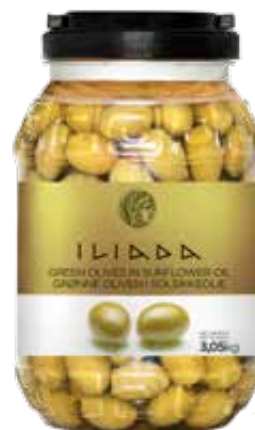
GREEN OLIVES IN SUNFLOWER OIL NW: 3,1kg / DW: 1,8kg