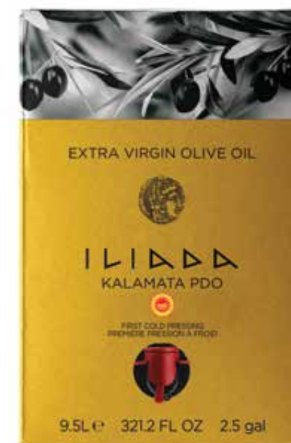
KALAMATA PDO Net Content: 9,5L