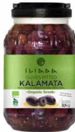
ORGANIC KALAMATA OLIVES PITTED IN EVOO NW: 3,1kg / DW: 1,6kg