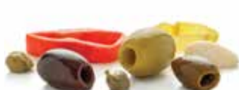
GREEK COCKTAIL OLIVES PITTED MIX