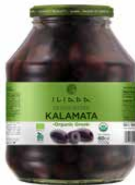
ORGANIC KALAMATA OLIVES PITTED NW: 1700g / DW: 900g