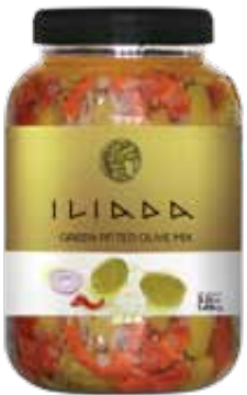
GREEN OLIVES PITTED MIX NW: 1,45kg / DW: 800g