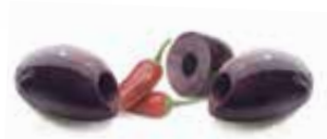
KALAMATA OLIVES PITTED SPICY