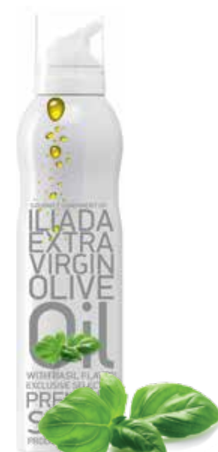
BASIL FLAVOR Net Content: 200ml