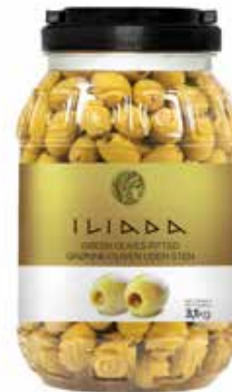
GREEN OLIVES PITTED NW: 3,1kg / DW: 1,6kg