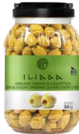
ORGANIC GREEN OLIVES PITTED NW: 3,1kg / DW: 1,6kg