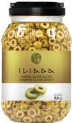
GREEN OLIVES SLICED NW: 3,1kg / DW: 1,8kg