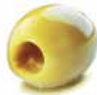
GREEN OLIVES PITTED GIGANTE