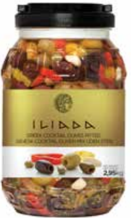
GREEK COCKTAIL OLIVES PITTED MIX NW: 3,1kg / DW: 1,9kg