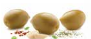
GREEN OLIVES SPICY