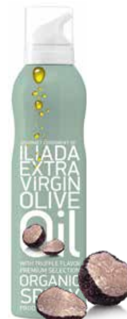
ORGANIC TRUFFLE FLAVOR Net Content: 200ml