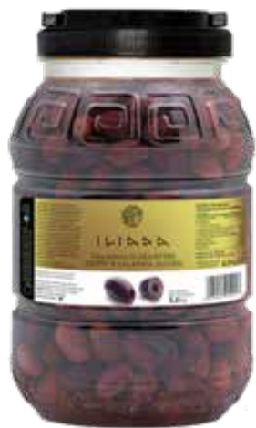
KALAMATA OLIVES PITTED NW: 5,2kg / DW: 2,7kg