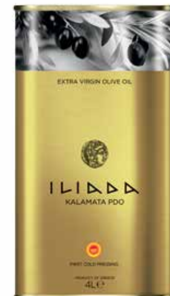
KALAMATA PDO Net Content: 4L