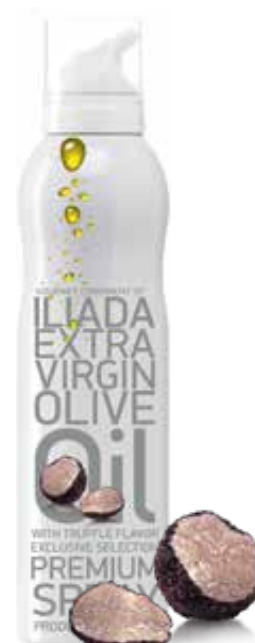
TRUFFLE FLAVOR Net Content: 200ml