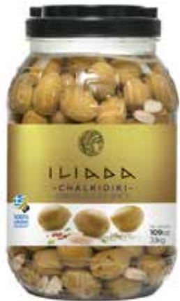
GREEN OLIVES SPICY NW: 3,1kg / DW: 1,8kg