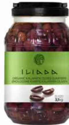
ORGANIC KALAMATA OLIVES QUARTERS NW: 3,1kg / DW: 1,8kg