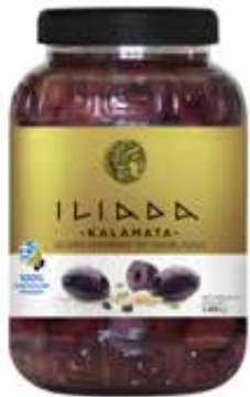
KALAMATA OLIVES PITTED WITH GARLIC NW: 1,45kg / DW: 800g