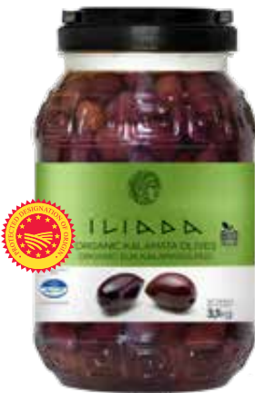
ORGANIC KALAMATA OLIVES (ELIA KALAMATAS PDO) NW: 3,1kg / DW: 1,8kg