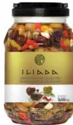
GREEK COCKTAIL OLIVES MIX NW: 3,1kg / DW: 2,1kg