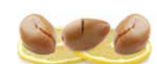
KALAMATA GREEN CRACKED OLIVES WITH LEMON