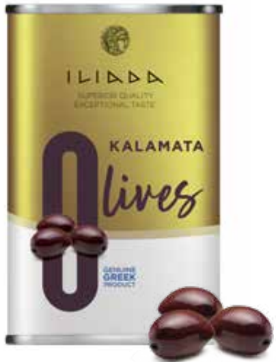
KALAMATA OLIVES NW: 19,5kg / DW: 13kg