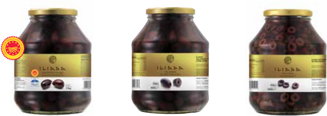
KALAMATA OLIVES (ELIA KALAMATAS PDO) NW: 1700g / DW: 1000g