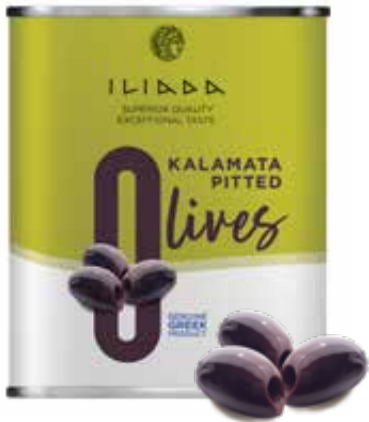
KALAMATA OLIVES PITTED NW: 8kg / DW: 4kg