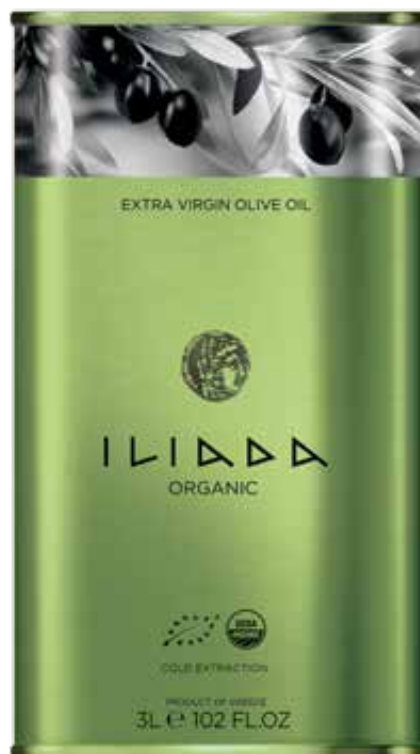
ORGANIC EVOO Net Content: 3L