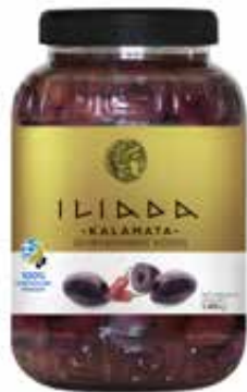
KALAMATA OLIVES PITTED SPICY NW: 1,45kg / DW: 800g