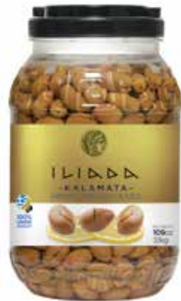
KALAMATA GREEN CRACKED OLIVES WITH LEMON NW: 3,1kg / DW: 1,8kg