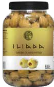
GREEN OLIVES PITTED NW: 1,45kg / DW: 800g