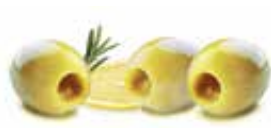
GREEN OLIVES PITTED WITH LEMON