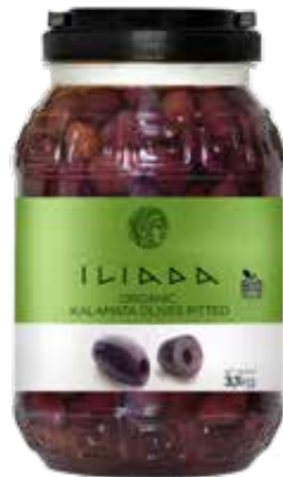
ORGANIC KALAMATA OLIVES PITTED NW: 3,1kg / DW: 1,6kg