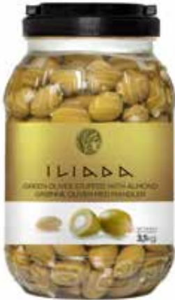
GREEN OLIVES STUFFED WITH ALMOND NW: 3,1kg / DW: 1,8kg