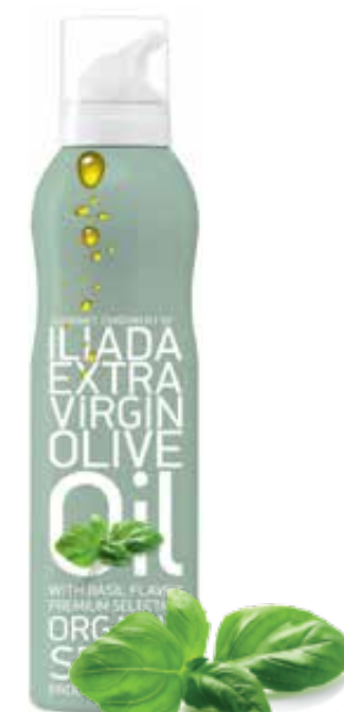
ORGANIC BASIL FLAVOR Net Content: 200ml