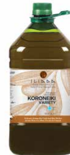
KORONEIKI VARIETY Net Content: 3L