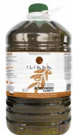
KORONEIKI VARIETY Net Content: 5L