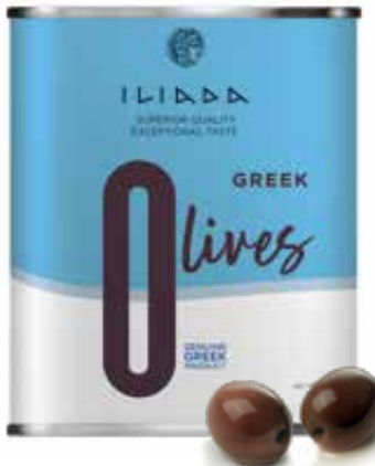
BLACK OLIVES NW: 8kg / DW: 5kg