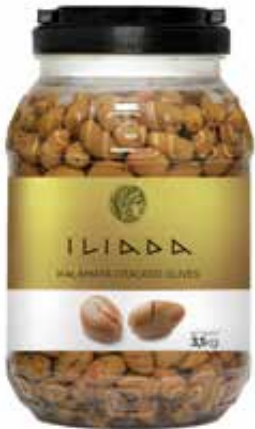
KALAMATA CRACKED OLIVES NW: 3,1kg / DW: 1,8kg