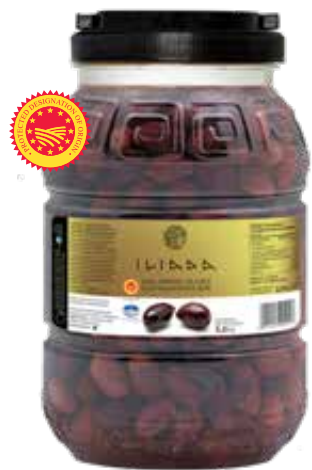
KALAMATA OLIVES (ELIA KALAMATAS PDO) NW: 5,2kg / DW: 3kg