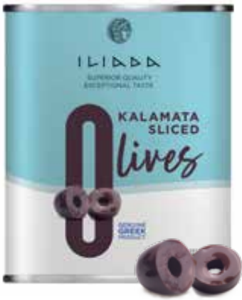
KALAMATA OLIVES SLICED NW: 8kg / DW: 5kg