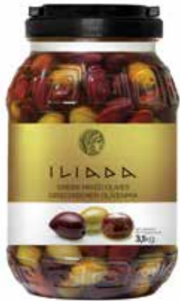
MIXED OLIVES NW: 3,1kg / DW: 1,8kg