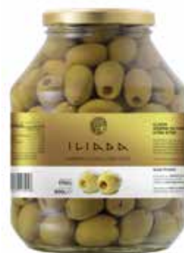
GREEN OLIVES PITTED NW: 1700g / DW: 900g