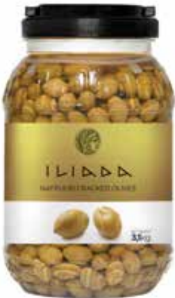
NAFLION CRACKED OLIVES NW: 3,1kg / DW: 1,8kg