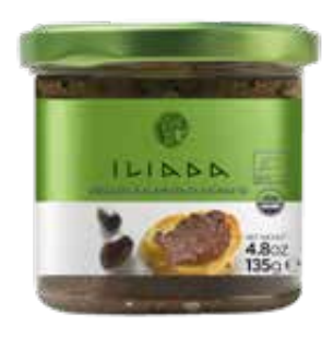
ORGANIC KALAMATA OLIVE PASTE NW: 135g