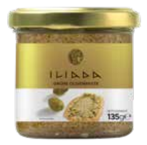
GREEN OLIVE PASTE NW: 135g