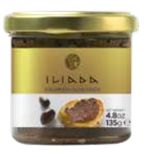
KALAMATA OLIVE PASTE NW: 135g

4 - ILIADA - Quality tradition & value all in one Brand