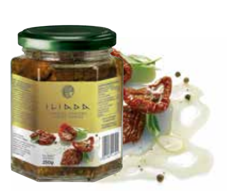
SUNDRIED TOMATOES NW: 280g / DW: 150g