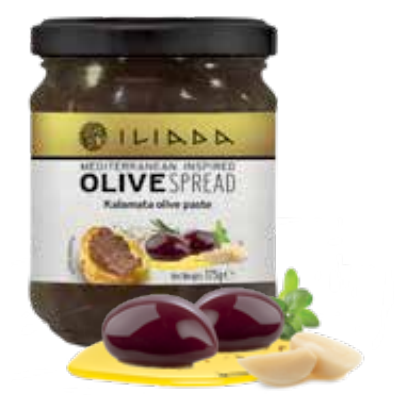
KALAMATA OLIVE SPREAD WITH EXTRA VIRGIN OLIVE OIL NW: 175g